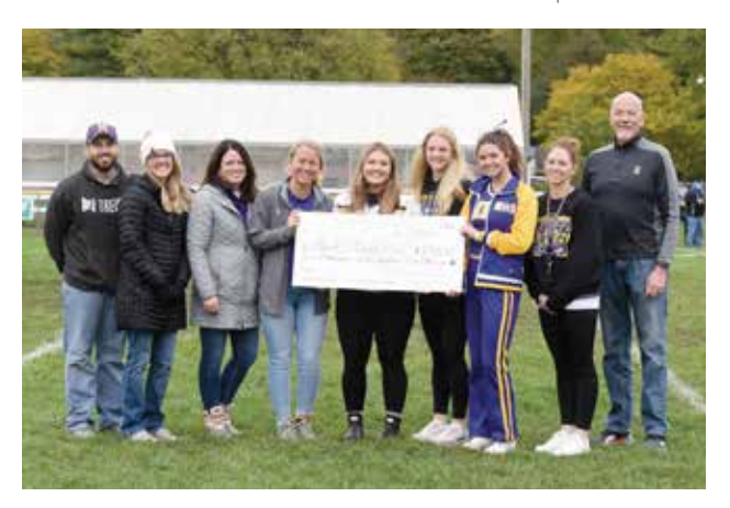
Monticello High School Pep Club leaders and advisors present a check for $2,750 in support of Paint Piatt Pink to Kirby Medical Center representatives during a football game on October 30, 2021.

Kirby would like to give a huge shoutout of appreciation to the Monticello High School Pep Club and its advisors for their incredible enthusiasm and for the multiple ways they made a difference in support of Paint Piatt Pink. Their generous $2,750 donation makes an impact on our efforts to provide comfort and assistance to local breast cancer patients.